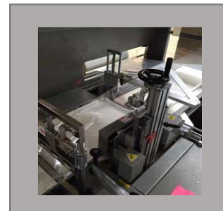
Side Sealing (upstream)