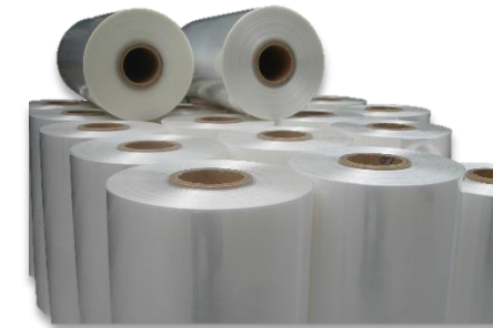
PE Shrink Film