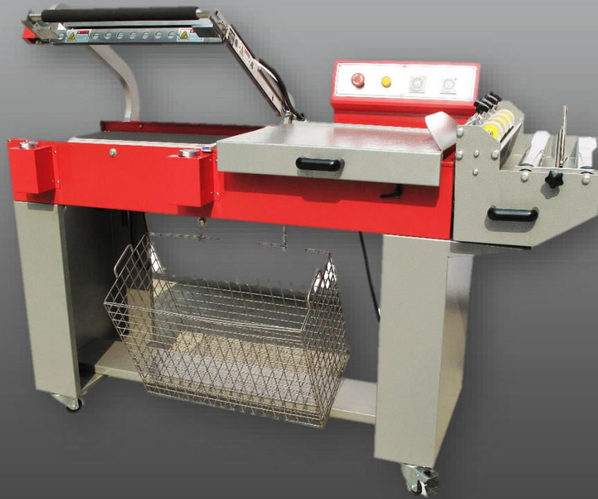
Semi-Automatic L- Bar Sealer

Semi-Automatic L-Bar Sealer + Shrink Tunnel