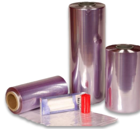
PVC Fine Shrink Film