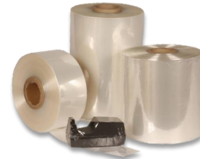
Polyolefin Shrink film