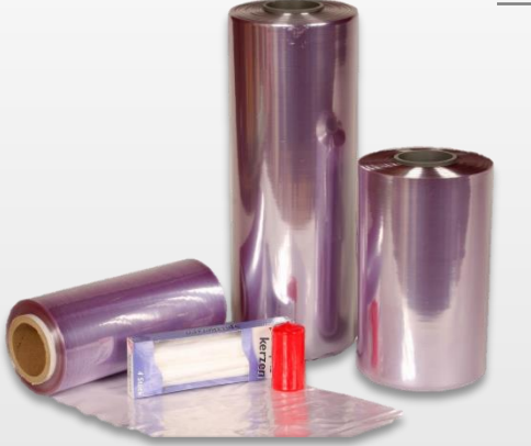
PVC Fine Shrink Film