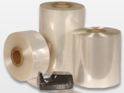
Polyolefin Shrink film